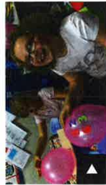
Children's summer scheme in Cardiff 'a lifeline' for parents

25 August 2015 Last updated at 17:45 BST