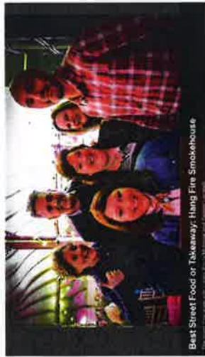
The Winners of the Food & Farming Awards 2015 The winners receive their prized cropping boards at a ceremony in Caege Green. Blas!

Food Cardiff is working to secure the future of Bessemer Rd Wholesale market Meeting with Deputy Minister for food and farming